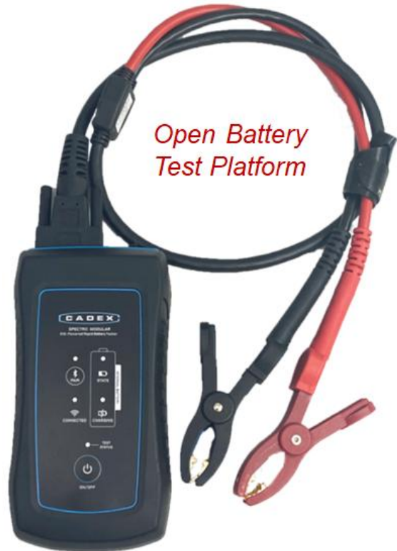
Spectro CM-24 battery rapid-tester

Test batteries can be QR-coded for easy data retrieval with Cloud Analytics. The QR code also stores matrices to turn the Spectro CM-24 into an open platform to test diverse batteries with available matrices.