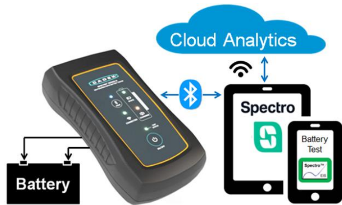
Connectivity leads to cloud analytics

The optional Cloud Analytics stores test results in the cloud to track battery health and to share results with fleet supervisors. Cloud Analytics provides predictive battery analysis that simplifies fleet management by fully using each battery with call to replace before failure. Accidental downtimes caused by a weak battery is virtually eliminated.