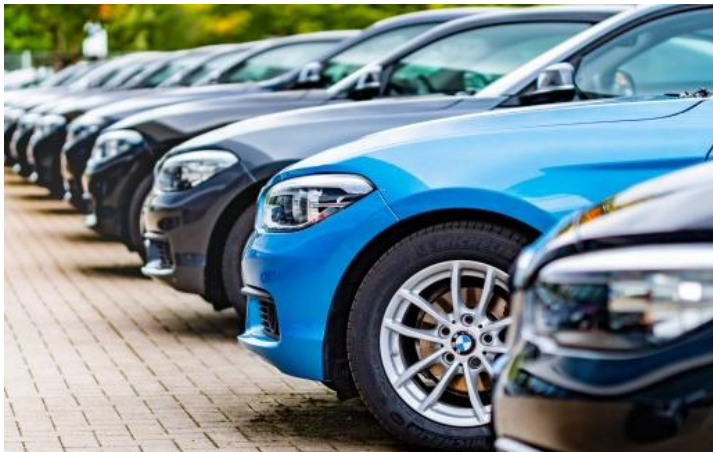
Predict battery life by assessing capacity