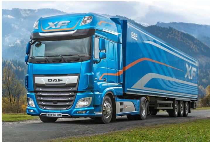
Predict battery life by assessing capacity